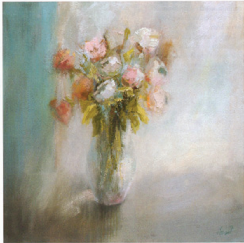
Angela Nesbit, Blues Never Fade Away , oil, 40 x 40"