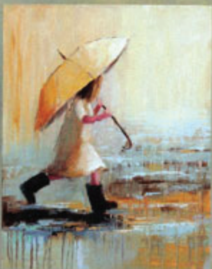
South Central Rain , 20" x 24" Oil