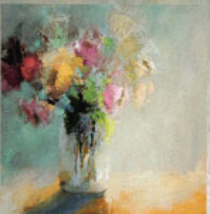
Market Bouquet , 30" x 30" Mixed Media