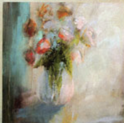
Say It With Flowers , 30" x 30" Oil