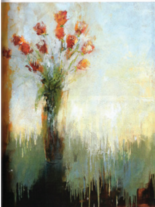
Angela Nesbit, Mystic Red , oil, 60 x 48"