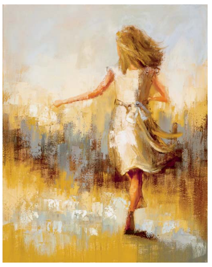
SKIPPING IN GOLD, OIL ON LINEN, 30 X 24"